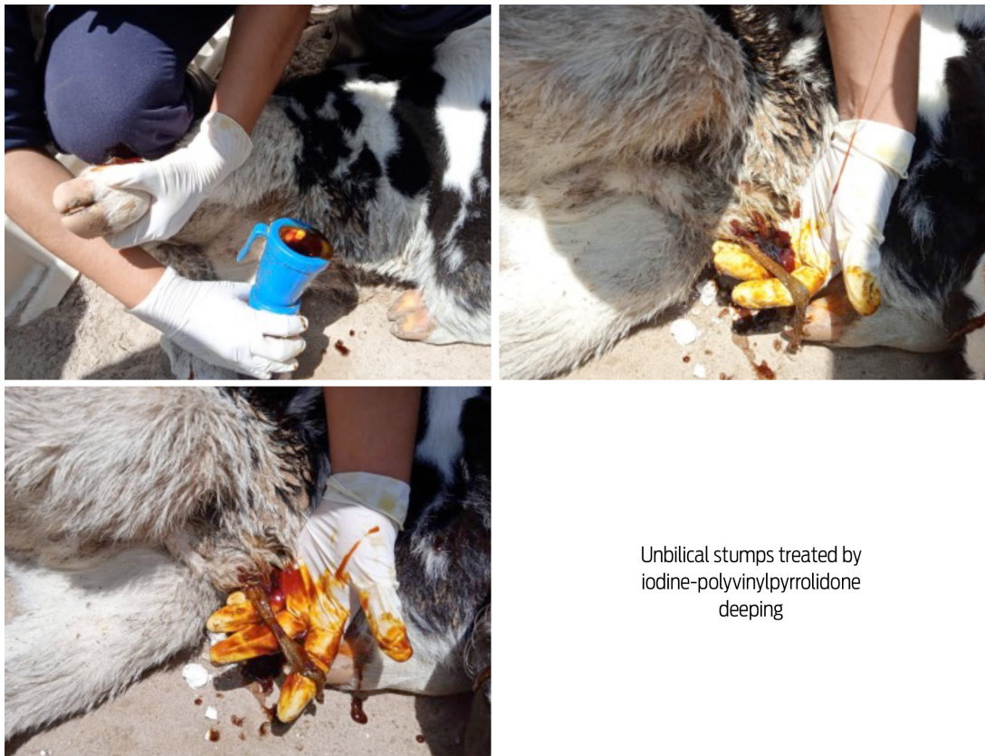
Unbilical stumps treated by iodine-polyvinylpyrrolidone deeping