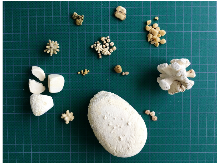
Figure 1. Different types of uroliths. Note the differences in shape, size, color, and number; however, none of these characteristics is specific to a particular mineral composition.